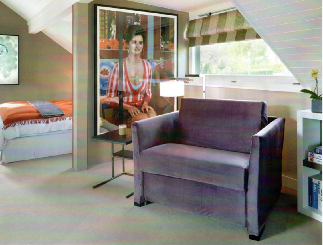
of the guest bedrooms. Photograph by the Chapuisat Brothers "L'oeil", 2006. Armchair ani Collection, reading lamp Swing Still by LMH, low lacquered bookcase AGT. graph by Gregor Hildebrandt "Vor dem Lied (Volver)", 2007